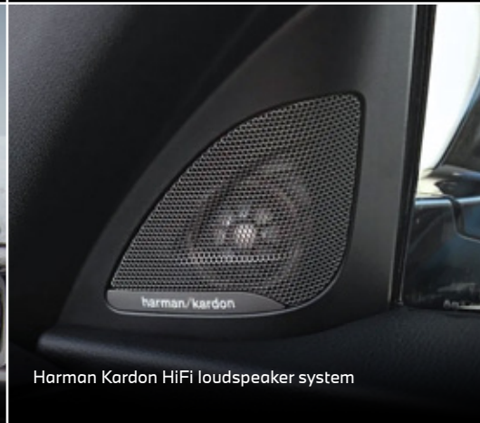
Harman Kardon HiFi loudspeaker system