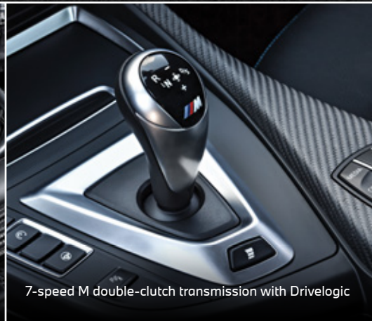
7-speed M double-clutch transmission with Drivelogic