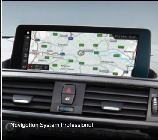
Navigation System Professional