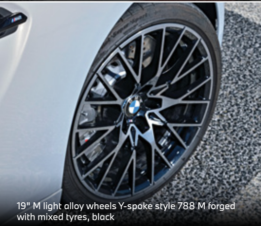
19" M light alloy wheels Y-spoke style 788 M forged with mixed tyres, black

Car specifications may vary from the model shown. Options and features available are model-dependent.