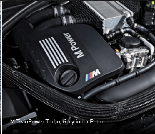
M TwinPower Turbo, 6-cylinder Petrol