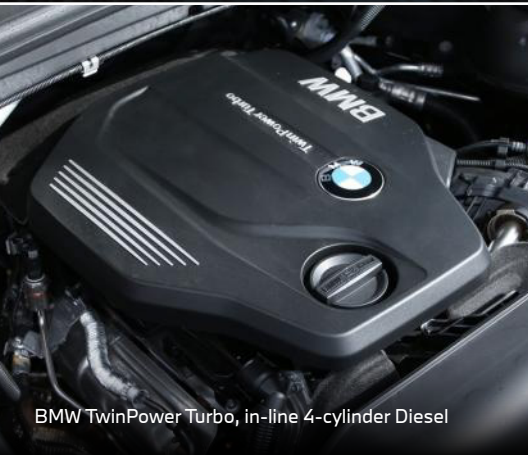
BMW TwinPower Turbo, in-line 4-cylinder Diesel

Car specifications may vary from the model shown. Options and features available are model-dependent.