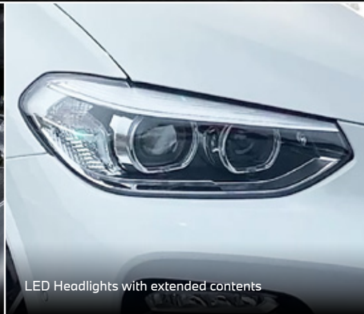
LED Headlights with extended contents