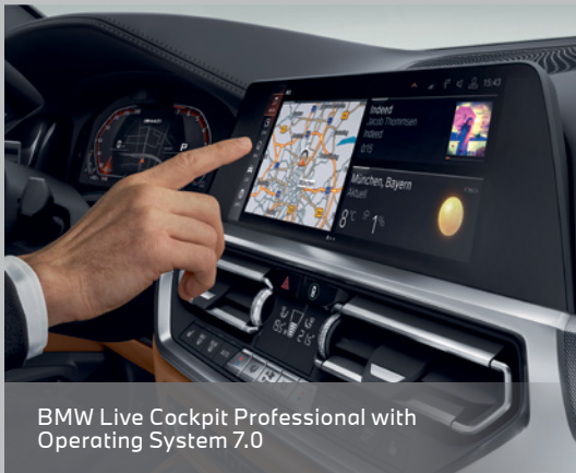
BMW Live Cockpit Professional with Operating System 7.0