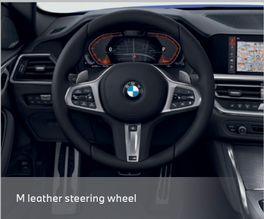
M leather steering wheel